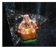
Ceramic Chinggis, 5 in. tall, $10