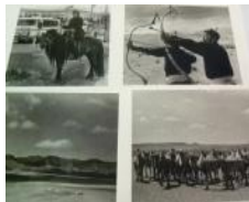
Black and white postcards 8 cards for $5