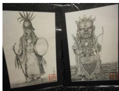
Mat-framed pencil drawings 6 x 8.5 inches, $20 ea.