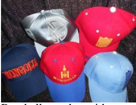
Baseball type hat with Mongol designs, $20 ea.