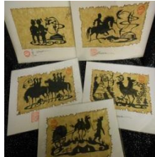
Paper cuts, some mat-framed, 8 x 5.5 in. $8 ea.