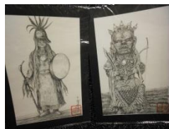
Mat-framed pencil drawings 6 x 8.5 inches, $20 ea.