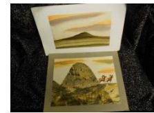
Mat-framed watercolors 9 x 8 inches, $10 ea.