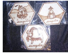
Octagon thick felt designs, 6 x 5 inches $10 ea.