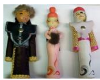
Wooden Mongolian dolls, male or female, approx. 7" tall. $8 ea