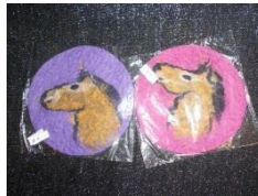
Felt with designs, $5 ea.