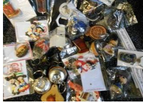
Key chains with Mongol designs, $4 ea.