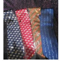
Mongolian silk ties, $20 ea.