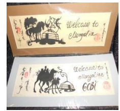
Mat-framed paper cut 13 x 5 inches. $10 ea.