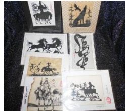
Small paper cuts, various sizes, $5 ea.