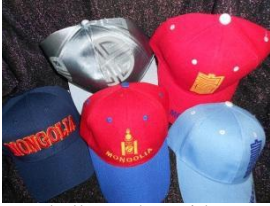
Baseball type hat with Mongol designs, $20 ea.