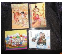
Color postcards $1.50 ea or all four for $5