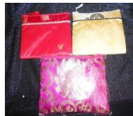
Silk zippered wallets Red & yellow 5 x 4 in. $10 Pink 6 x 4.5 in. $12