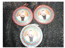
Leather Chinggis medallion comes with loop for hanging $8 ea.