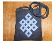
Denim purse with shoulder strip and Mongol design, 7 x 9 inches $15