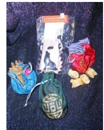
Shanghai in silk or leather drawstring bags, comes with instructions, $12 ea.

*Made by the Mongolian Quilting Center, which trains unemployed women providing skills to generate income for their families.