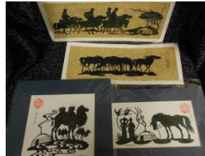
Paper cuts, some mat-framed various sizes, $10 ea.