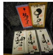
Mat-framed calligraphy, sky, mountain, horse, Chinggis, 4.5 x 11 in. $8 ea.