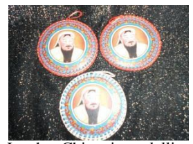
Leather Chinggis medallion comes with loop for hanging $8 ea.