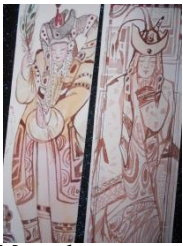
Mongol women painted on canvas 3.5 x 10 in., $10 ea.