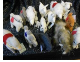
Stuffed felt animals, i.e., goats, camel, sm. horse, $8 sheep, $9; yaks & lg. horse $10