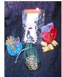
Shanghai in silk or leather drawstring bags, comes with instructions, $12 ea.

*Made by the Mongolian Quilting Center, which trains unemployed women providing skills to generate income for their families.