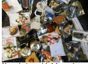
Key chains with Mongol designs, $4 ea.