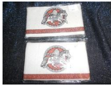
Felt zippered purse, 7 x 4 inches, $15 ea.