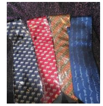
Mongolian silk ties, $20 ea.