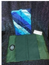
Silk book covers* Blue and green 6 x 12 inches, $15