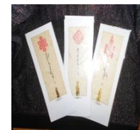
Mat-framed parchment with Classical Script calligraphy and symbols 4 x 10 in., $6 ea.