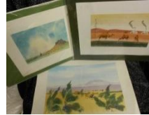
Mat-framed watercolors 13.75" x 10.75". $25 ea