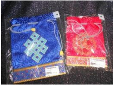
Silk drawstring bags Red. 4.5 x 6 inches $10 Blue, 6 x 8 inches $12