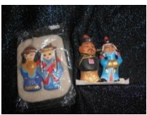
Ceramic figurines, $10 ea Ceramic on felt, 4 x 5 in. Standing ceramic, 4 in tall

*Made by the Mongolian Quilting Center, which trains unemployed women providing skills to generate income for their families.