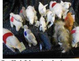
Stuffed felt animals, i.e., goats, camel, sm. horse, $8 sheep, $9; yaks & lg. horse $10